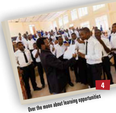
Over the moon about learning opportunities