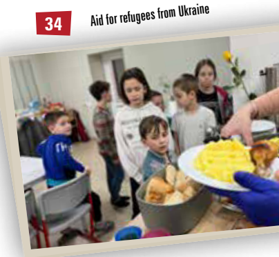
Aid for refugees from Ukraine