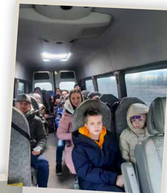
Ukrainian children fortify themselves at Ceadir-Lunga

In small buses, numerous people were brought to safety across the border from Ukraine to the Republic of Moldova