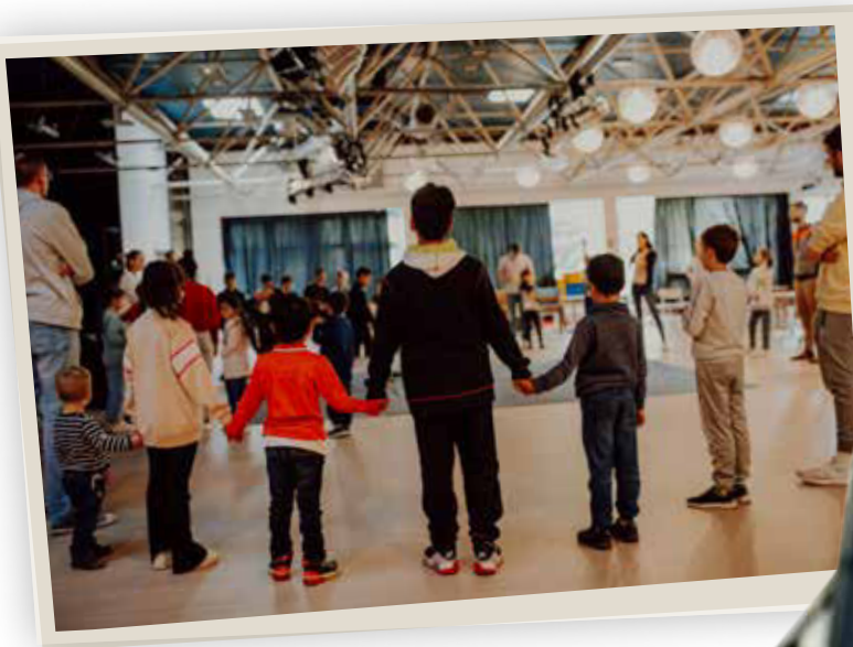
You are welcome — this is what the Family Community Centre in Dortmund teaches its young and not so young members

The living situation of many inhabitants of the Dortmund's Nordstadt district is significantly worse than in the rest of the city; the unemployment rate is always far higher compared to the city. Residents have lower incomes, and fewer people complete secondary education, gaining high school or grammar school certificates. One reason for this: The district has become a first stop for people fleeing war, political persecution or economic hardship. In Germany, they hope to find a more peaceful and secure future. Officially inaugurated in 2010, the "Stern im Norden" offers these people and the other residents of the district many opportunities for coming into contact and meeting each other.