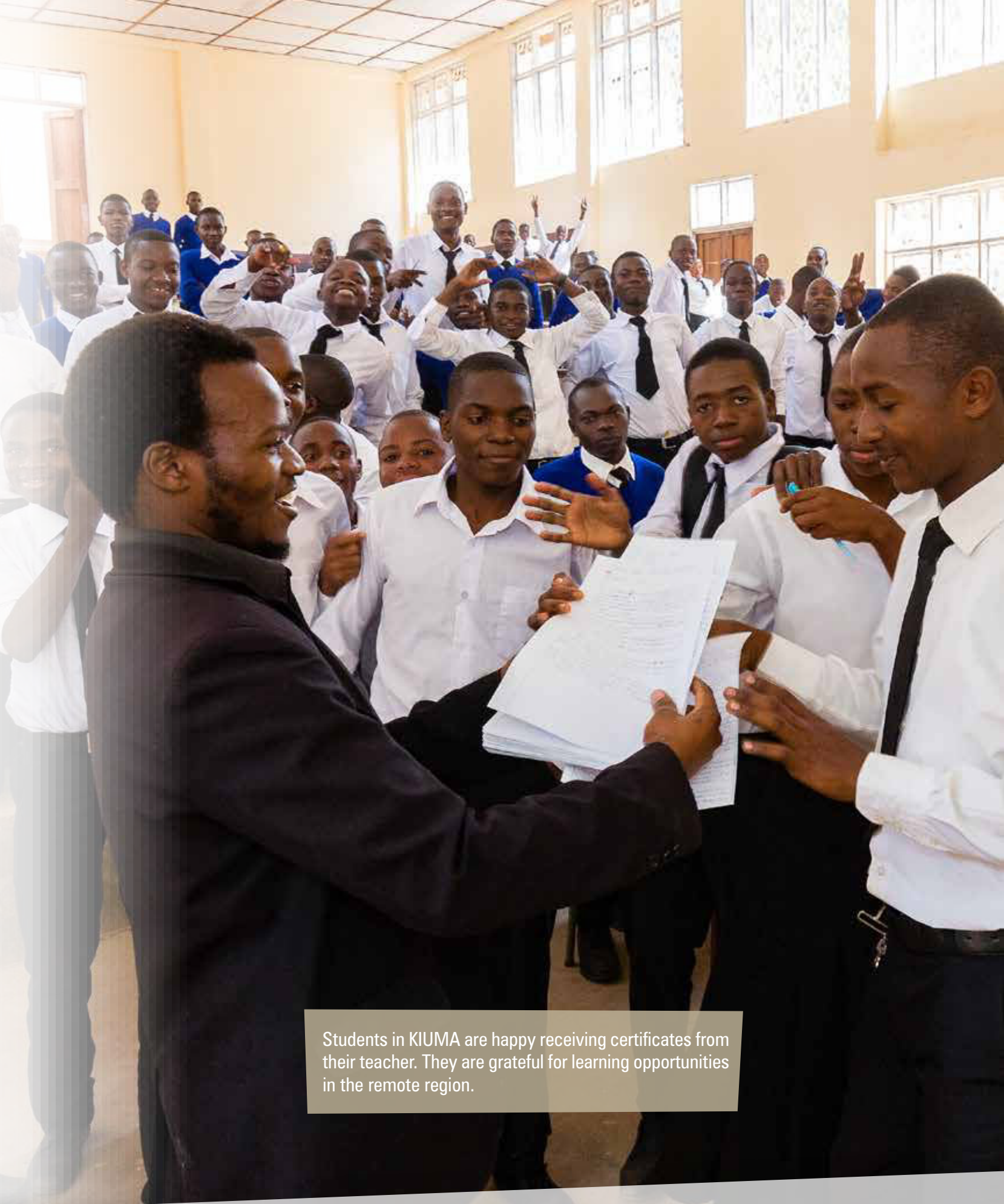
Students in KIUMA are happy receiving certificates from their teacher. They are grateful for learning opportunities in the remote region.