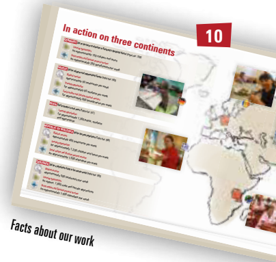
Facts about our work