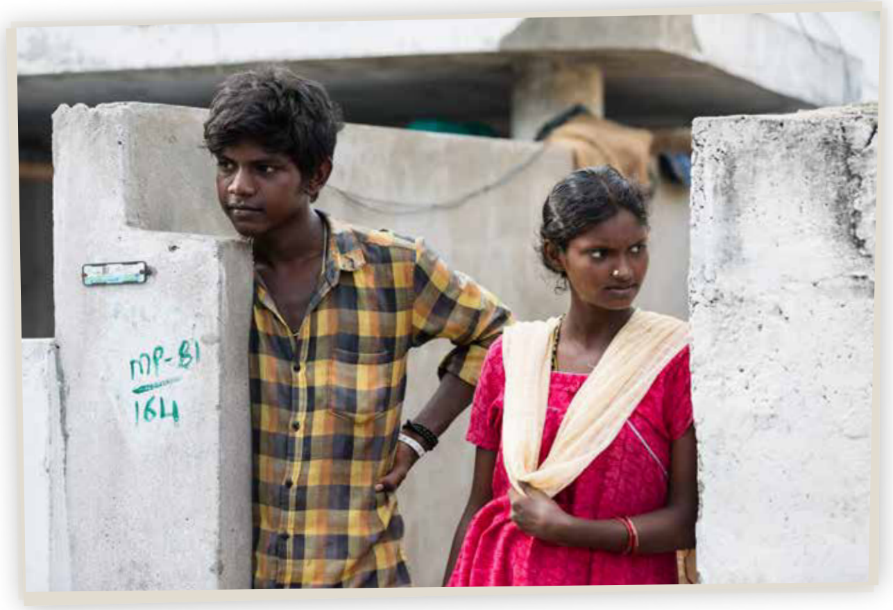
The support of foreign partners for projects in India has been under increased scrutiny for some time. Therefore, we no longer show pictures or people from our projects, but use general images depicting the country.

Over the course of the year, wortundtat has started working with three other organisations in India. This co-operation has been restricted to a limited period of time from the outset. The reporting on our work on these projects is intentionally low-key and more muted compared to the past. We do not want to get the aid workers in India and their organisations into trouble, and we aim to protect the recipients of aid from any reprisals.